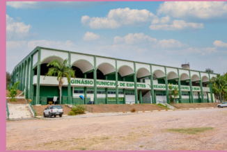
GINÁSIO MUNICIPAL VEREADOR PEDRO EZEQUIEL DA SILVA