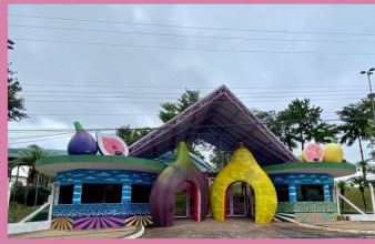
PARQUE MUNICIPAL MONSENHOR BRUNO NARDINI